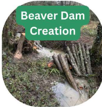
Beaver Dam Creation