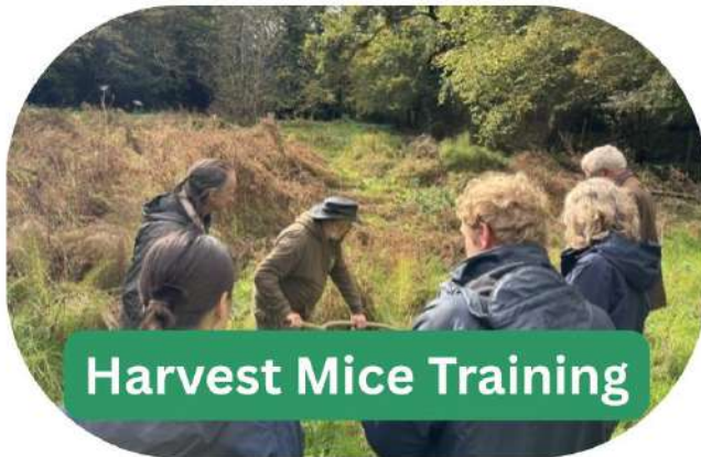
Harvest Mice Training